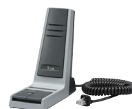
SM-28 Desktop microphone