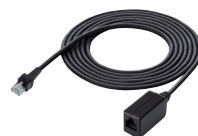
OPC-2355 2.5 m; 8.2 ft