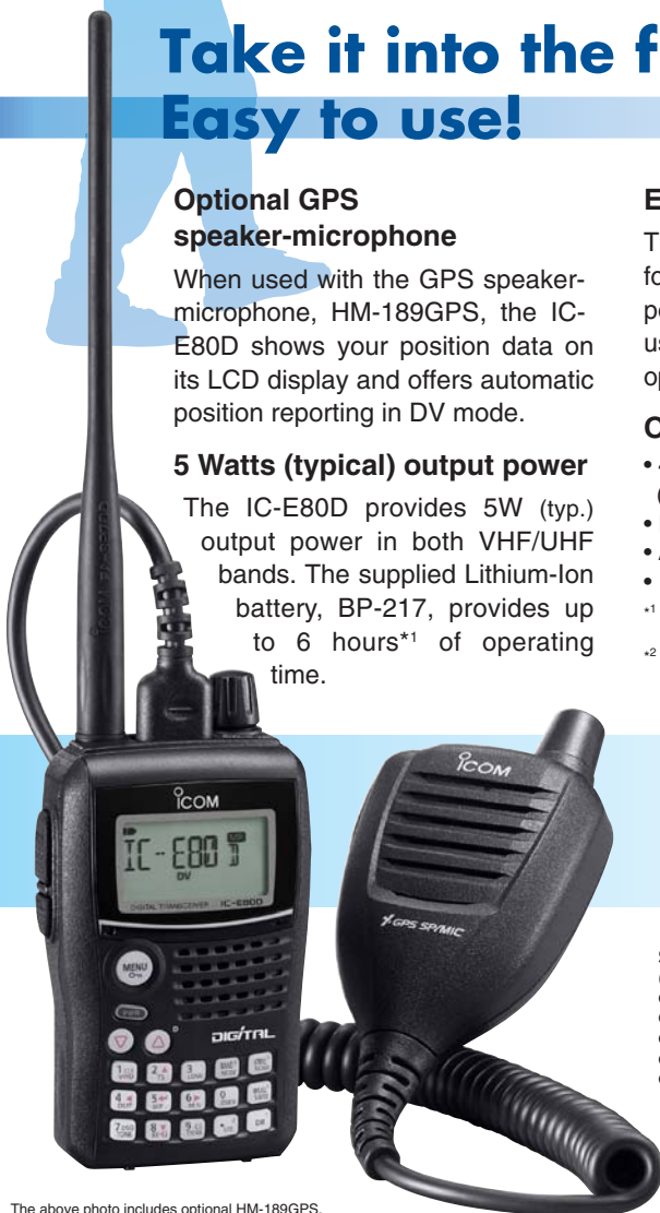
The above photo includes optional HM-189GPS.