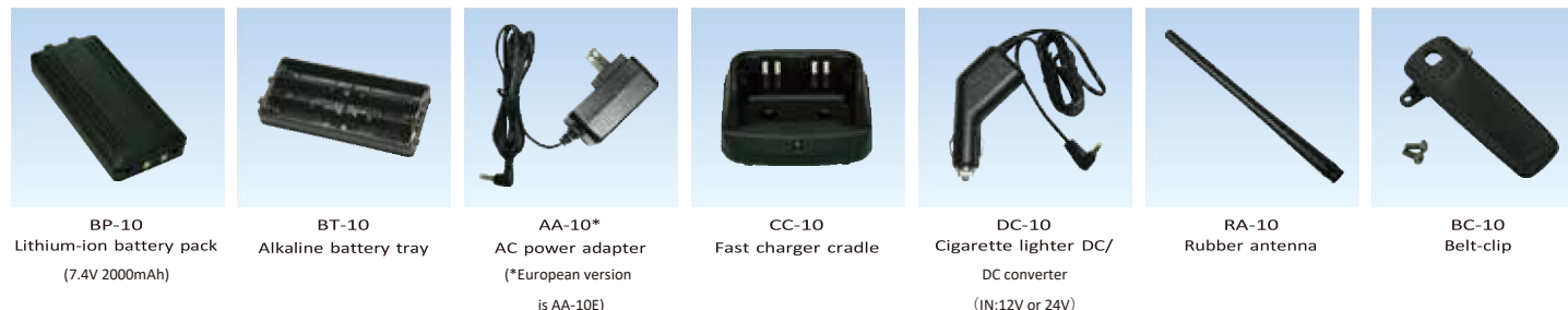
BP-10 Lithium-ion battery pack (7.4V 2000mAh)