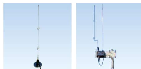
MA500 Mobile whip (25MHz-1.3GHz)