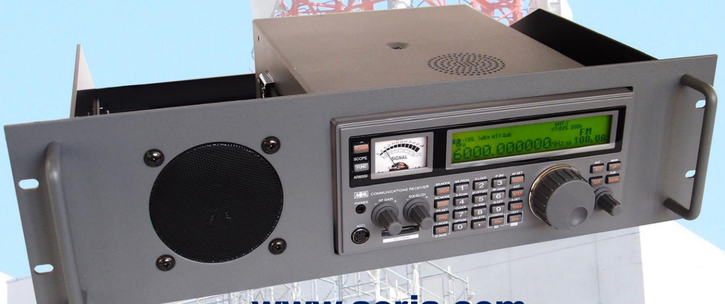
Photo of receiver with rack option HRE5001