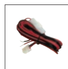
DC cable UA38Y UA-0038Y