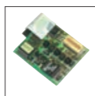
Digital modulation unit EJ-47U