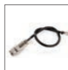
8-pin microphone adapter EDS-8