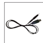
USB computer interface cable ERW-7

No part of this document may be reproduced, copied, translated or transcribed in any form or by any means without the prior written permission of Alinco, Inc., Osaka, Japan. All brand names and trademarks are the property of their respective owners. Alinco cannot be liable for pictorial or typographical inaccuracies.