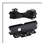
Control head separation kit EDS-30