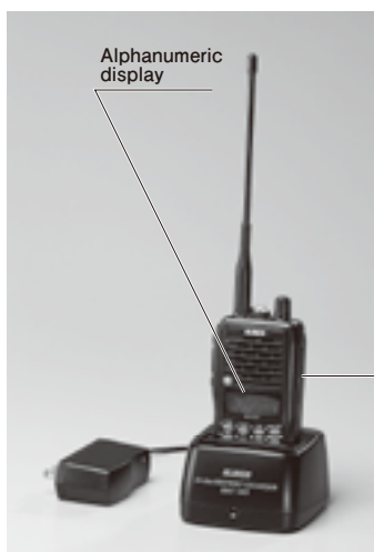
with optional Li-ion charger (E-version standard)