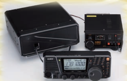
Shown with optional accessories.

Now you can enjoy the thrill of listening to live radio signals from all over the world with the Alinco DX-R8T/E. A new desktop radio designed to be affordable without compromising performance, the DX-R8T/E boasts a communications grade receiver circuit, 3 ceramic filters (FM/AM, SSB, CW) with narrow filter function, excellent 1ppm stability and a large, easy-to-read LCD screen. The I/Q mode with supporting SDR freeware lets you output the I/Q signal from the 3.5mm stereo jack and decode DRM using only a PC and a sound card. Simple operating commands and straight-forward key layout make this a radio that you can start enjoying from the moment you first turn it on. Packed with many features normally found only in more expensive receivers, the DX-R8T/E is ready to capture the imagination of everyone from a beginner in the world of shortwave to the most experienced shortwave listener.